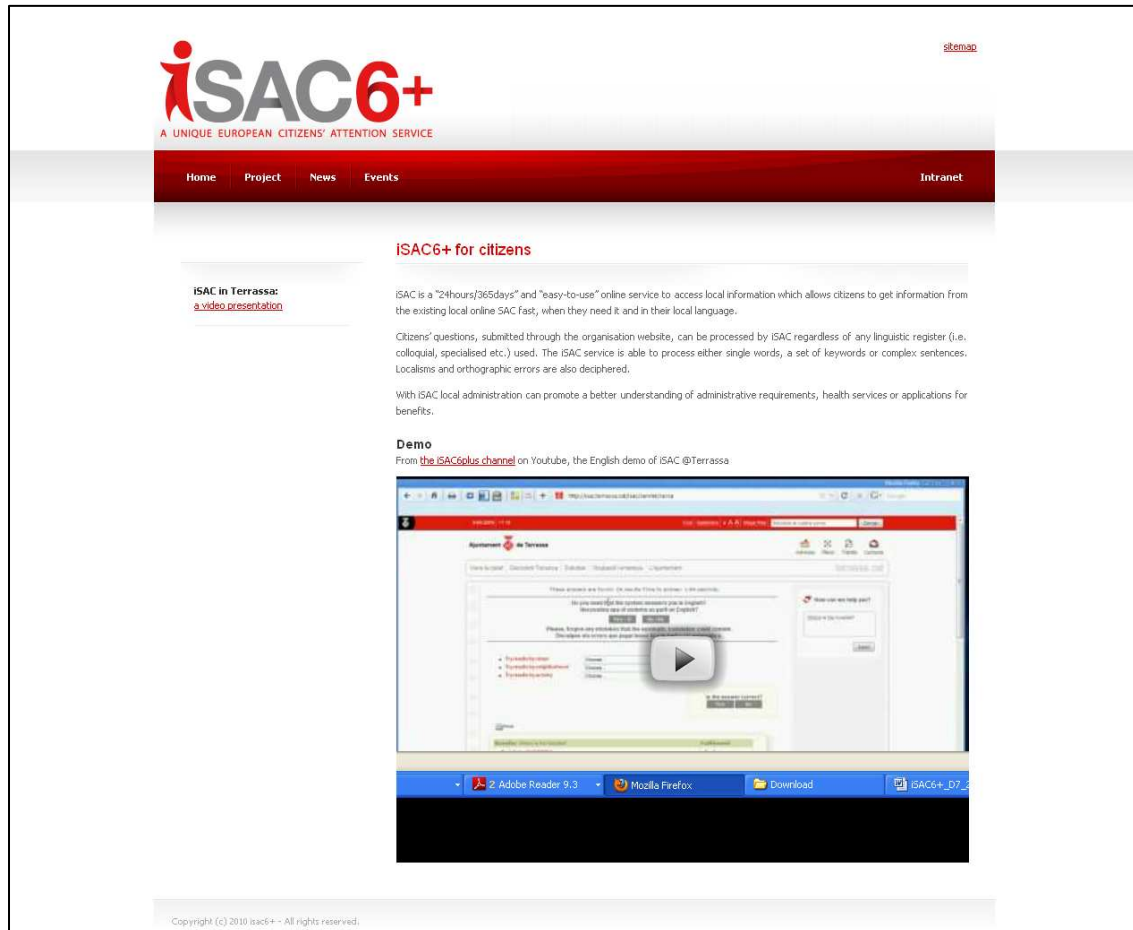
Figure 4. Citizens' page

The video presentation is linked from the isac6+ channel on www.youtube.com