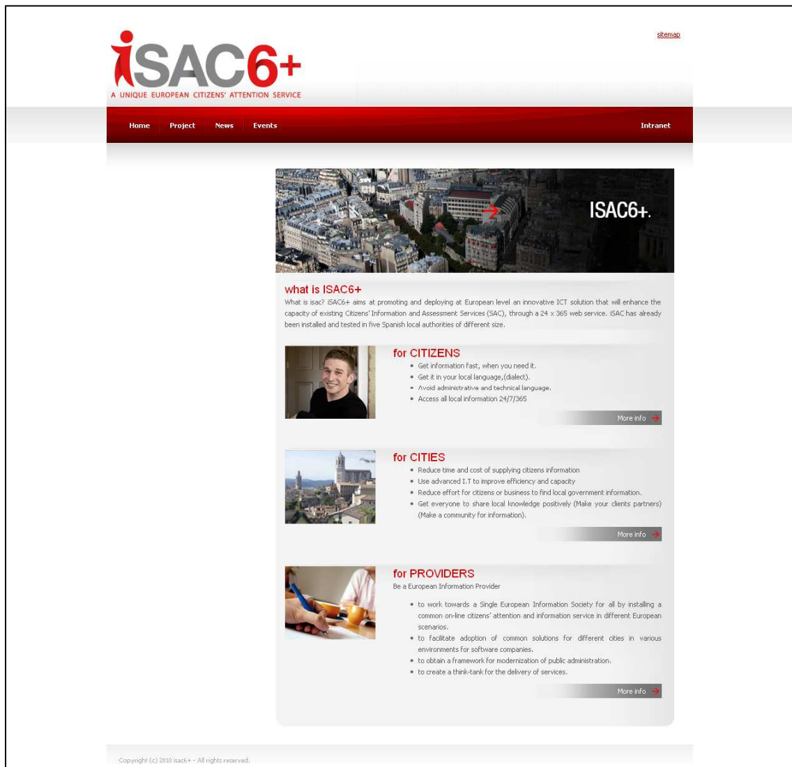
Figure 1. Home page

The home page (Figure 1) presents the main targets identified by the Dissemination plan (citizens, cities, service providers). For each target there's a short text with significant keywords phrases to capture individuals looking "topics".