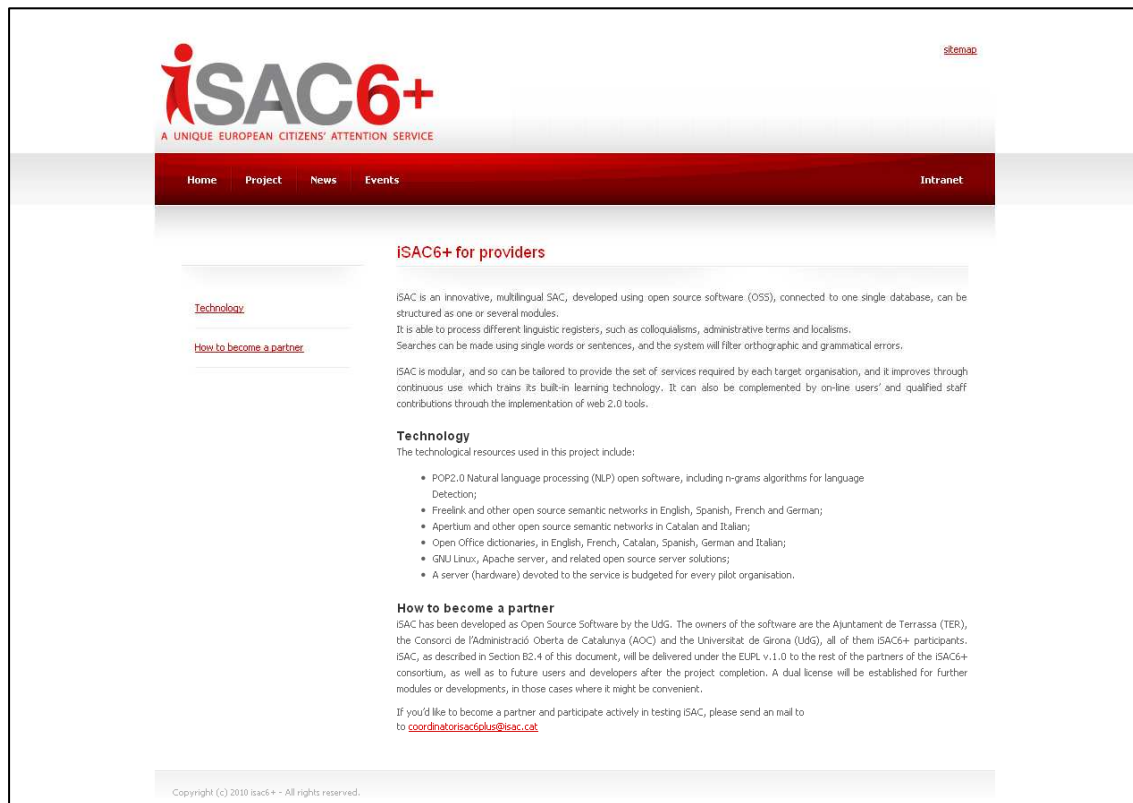
Figure 5. Providers page

This page (Figure 5) describes the advantages of the iSAC solution for a service provider interested in becoming a technological iSAC6+ partner.